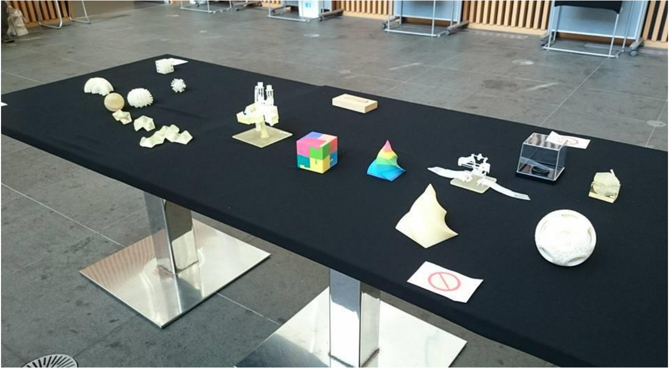
Figure 1: Sample of a wide figure. Caption (serif font, 9pt, numbered, e.g)